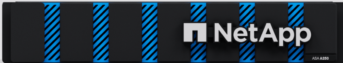
Table 1) ASA technical specifications