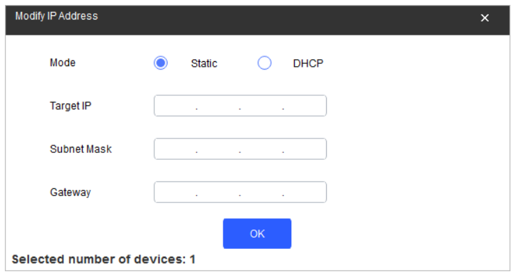
Figure 3-2 Change IP addresses in batches