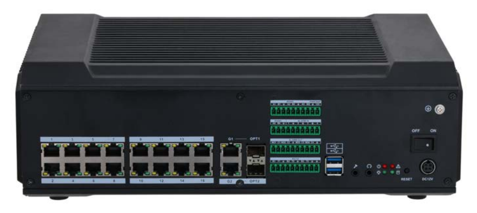
Figure 1-1 Device appearance