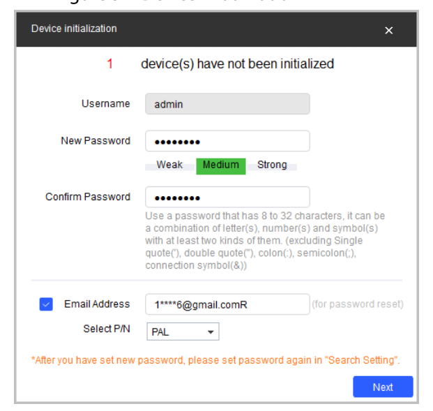
Figure 3-1 Device initialization

Step 2 Select a device to be initialized, and then click Initialize .