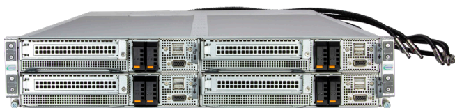
A+ Server AS -2126FT-HE-LCC “FlexTwin”

Liquid-Cooled Multi-Node Server for Maximum Density and Efficiency