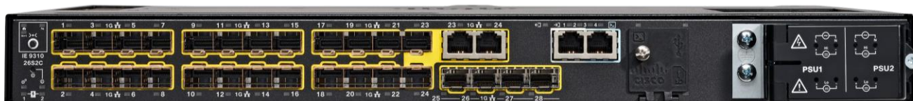
Figure 1. IE-9310-26S2C switch