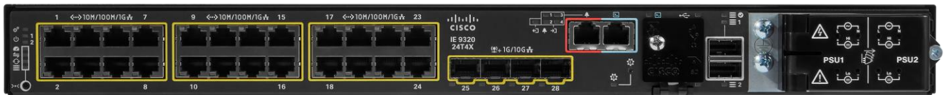
Figure 5. IE-9320-24T4X Switch