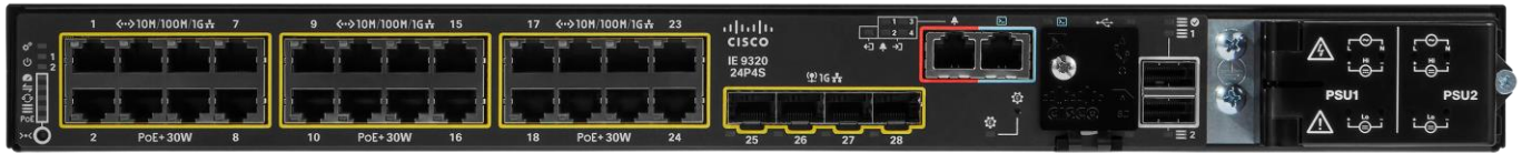
Figure 4. IE-9320-24P4S Switch