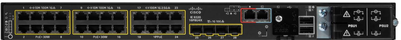
Figure 7. IE-9320-16P8U4X Switch with multi-gigabit and 4PPoE