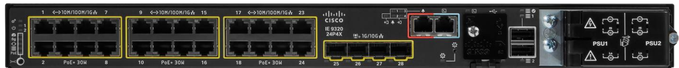
Figure 6. IE-9320-24P4X Switch