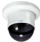
WV-QCD100G-W Dome Cover