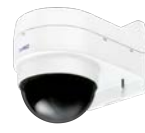
WV-QWD100G-W Wall Mount Bracket