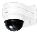
WV-QWD100C-W Wall Mount Bracket