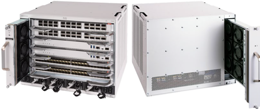
Figure 2. Cisco Catalyst 9606R Chassis with Fan Tray

Each Cisco Catalyst 9600 Series switch uses a single serviceable fan tray for cooling. The switches can optionally be accessed from the rear for flexible cable management. The chassis is optimized for enterprise closets, with side-to-side airflow. All fan trays are composed of multiple independently controlled fans. If any single fan fails, the system will continue to operate without a significant degradation in cooling. Fan speeds change dynamically to compensate for fan failure. Cisco Catalyst 9600 Series fans have a barometric sensor, which allows slower fan speed curves at lower altitudes. The fans also have individual Pulse-Wide Modulation (PWM) fine-tuning to reduce variability in fan revolutions per minute (rpm) under throttled conditions. The measured acoustic noise in a formal NEBS test environment is 77.7 LWAd (dB). The chassis are designed to accommodate fanless operation of up to 90 seconds to enable serviceability.