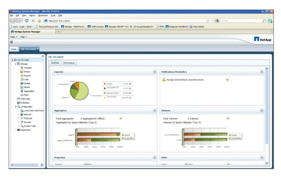
Figure 1) You don't need to be an expert to configure your storage with the simple, easy-to-use NetApp System Manager console.

• Protect your critical data more efficiently with integrated data protection by using NetApp technologies such as RAID-TEC<sup>™</sup> (triple-parity), RAID DP<sup>®</sup>, and Snapshot<sup>®</sup>.