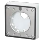
WV-QJB500-W Mount Bracket