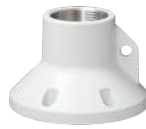
WV-QCL101-W Mount Bracket