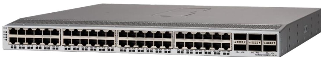
Figure 3. Cisco Nexus 93108TC-FX3P Switch

The Cisco Nexus 93108TC-FX3P Switch (Figure 3) is a compact 1 RU switch that supports 2.16 Tbps of bandwidth and 1.2 Billion packets per second (Bpps). Offering flexible port-speed configurations, the switch supports 48 ports of 100M/1/2.5/5/10G BASE-T on the downlinks. The 6 uplink ports support 40/100G QSFP 28. The 93108TC-FX3P is well suited for network customers requiring more versatility and flexibility in networking speeds.