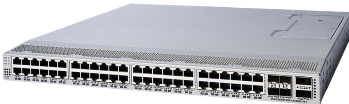
Figure 4. Cisco Nexus 9348GC-FX3 Switch

The Cisco Nexus 9348GC-FX3 Switch (Figure 4) is a 1RU switch that supports 696 Gbps of bandwidth and over 517 Mpps. The 48 1GBASE-T downlink ports on the 9348GC-FX3 can be configured to work as 10-Mbps, 100-Mbps, or 1-Gbps ports. The 4 ports of SFP28 can be configured as 1/10/25-Gbps and the 2 ports of QSFP28 can be configured as 40- and 100-Gbps ports, or a combination of 10-, 25-, 40, 50-, and 100-Gbps connectivity, offering flexible migration options.