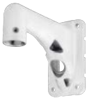
WV-QWL501S-W Wall Mount Bracket