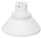
WV-QSR506S-W Mount Bracket